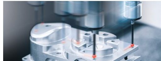
Accelerate the sequencing process while staying in control